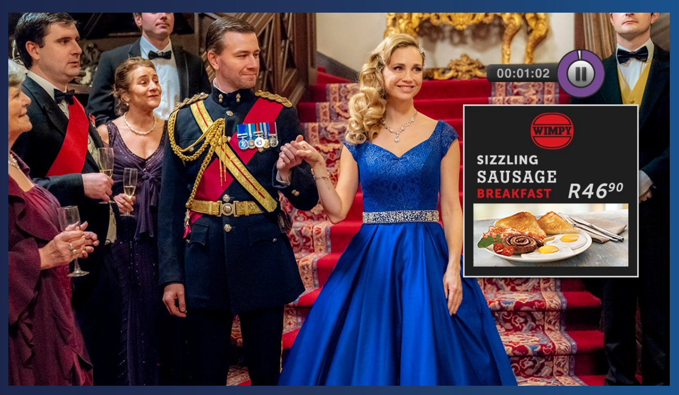
EXAMPLE OF PAUSED VIDEO WITH ADVERT ONLY

(Note - the on-screen play/pause/rewind/forward/slomo icon will be applied by the set-top box and does not need to be applied in the ad design.)