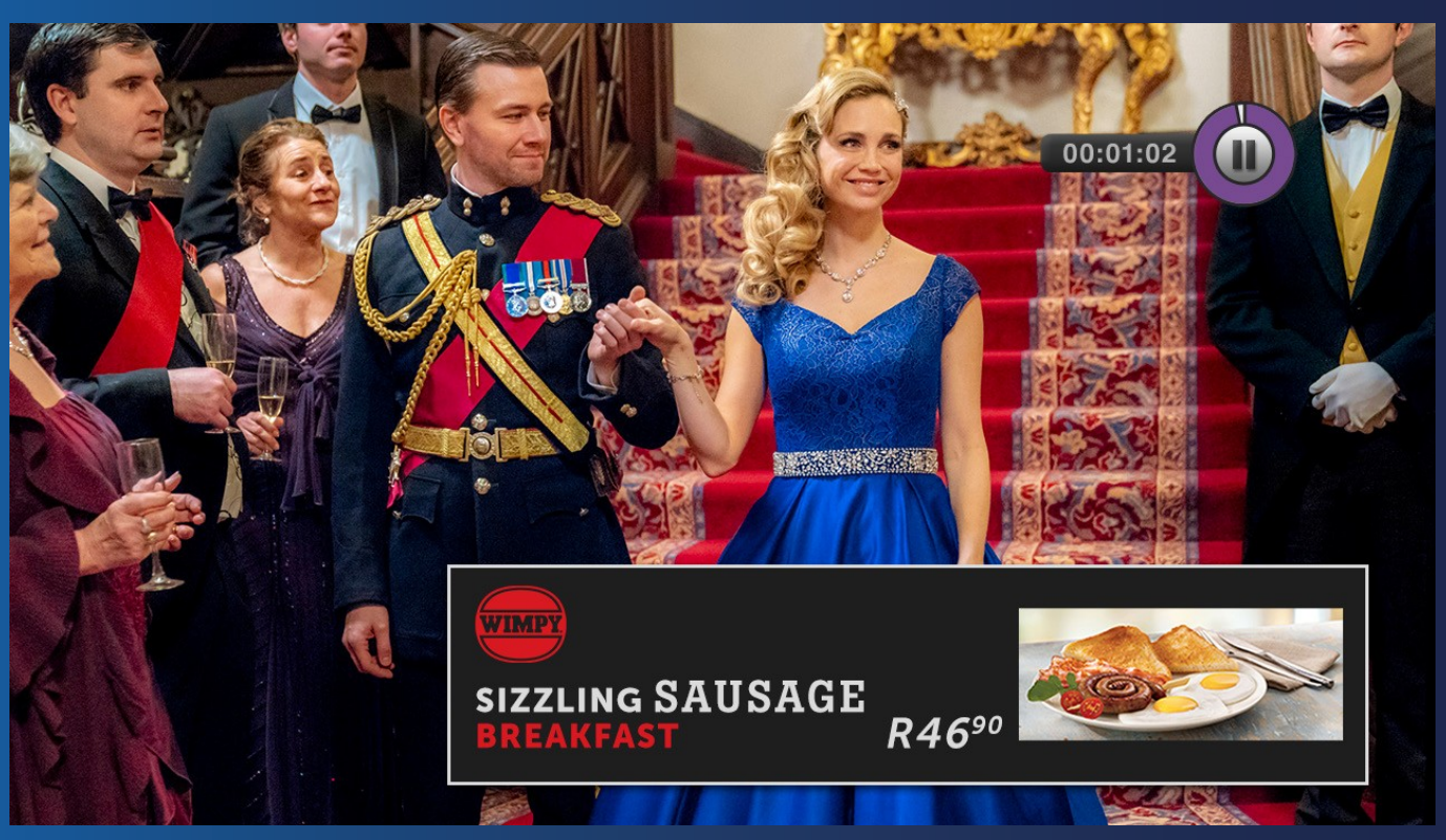
EXAMPLE OF PAUSED VIDEO WITH ADVERT ONLY

(Note - the on-screen play/pause/rewind/forward/slomo icon will be applied by the set-top box and does not need to be applied in the ad design.)